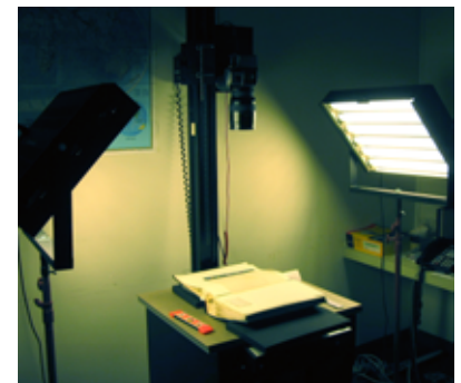
Camera Setup at the Library of Congress

collection of Lincoln documents in the world. The great majority of the material relates to Lincoln's presidential years and includes some extremely significant documents, such as Lincoln's draft of his second inaugural address.